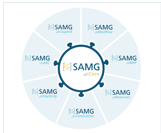
Fig. 2: SAMG and its extension modules.

This portfolio is under continuous development to feature state-of-the-art multigrid approaches.